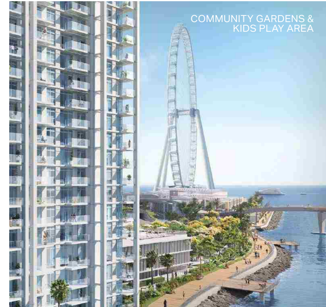
COMMUNITY GARDENS & KIDS PLAY AREA