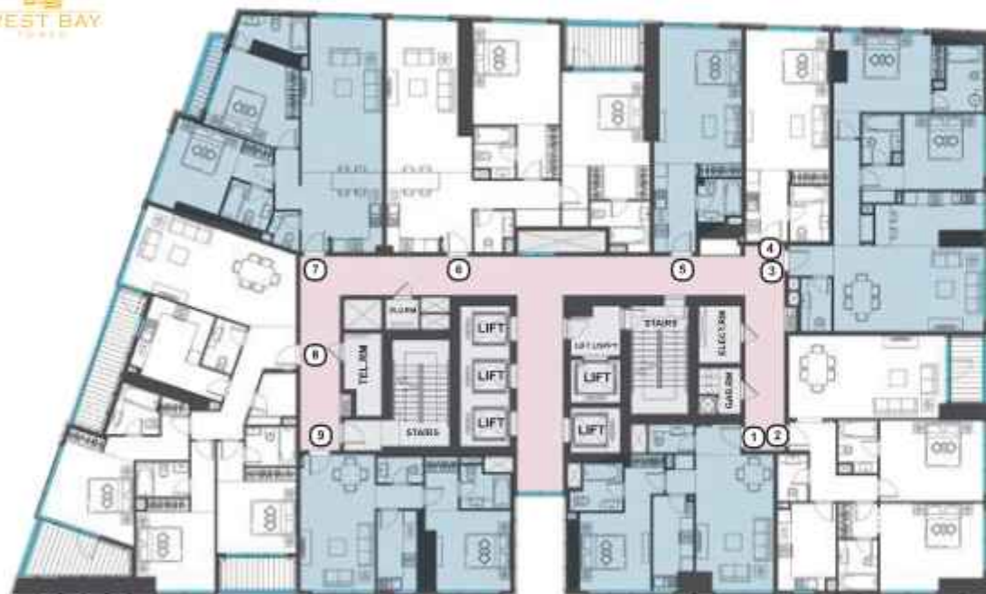
TYPICAL FLOOR PLAN 04 -15