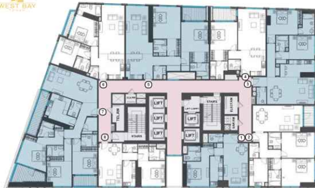
TYPICAL FLOOR PLAN 17 - 34